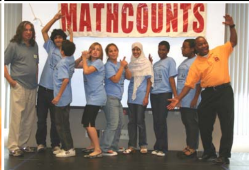
Lincoln Park Academy