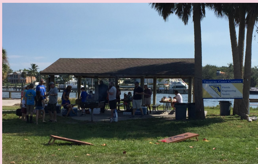
"Party at the Park" Sandsprit Park, Stuart