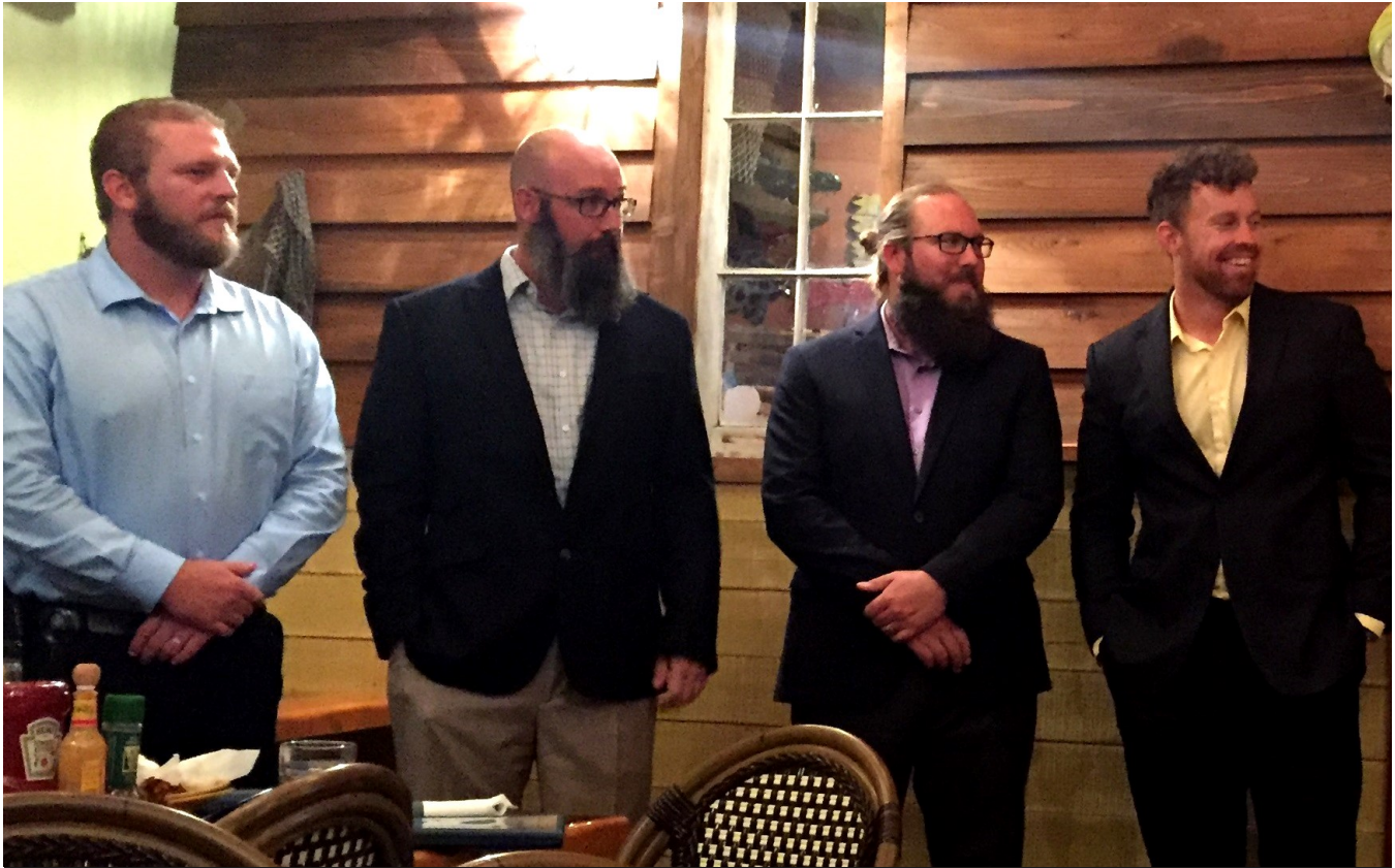
The installment of the 2016 Board members!