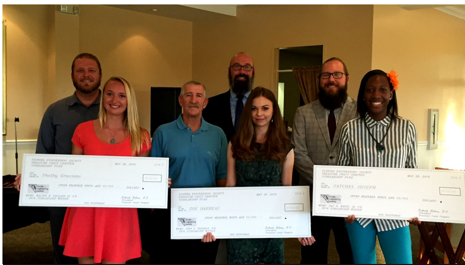
Congratulations to the 2016 TC FES Scholarship Award Winners!